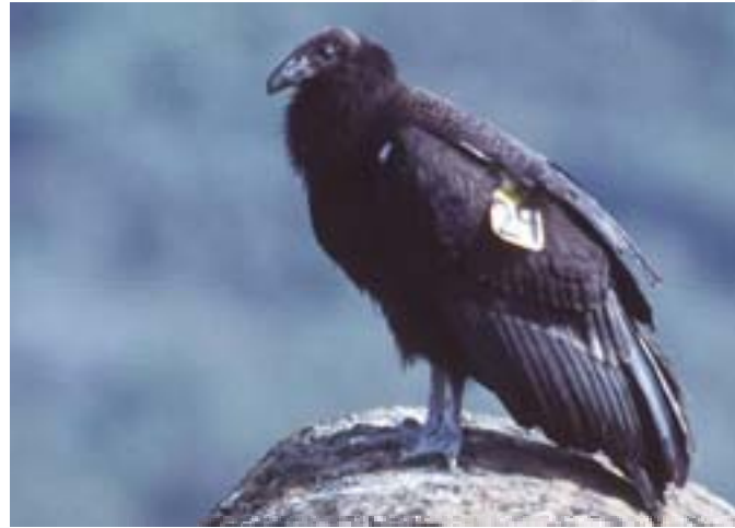
California condor Gymnogyps californianus

Based ISIS data on zoo breeding efforts for a related species, ISIS members have cooperated on a captive breeding program for this species.