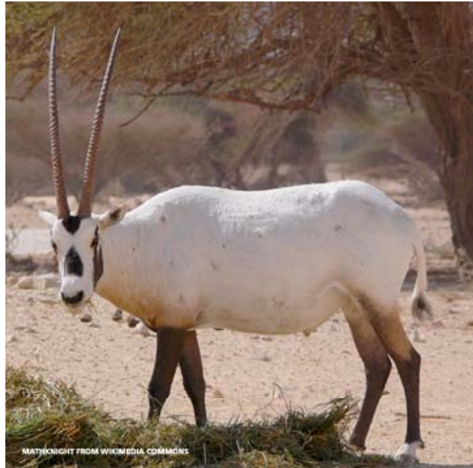
Arabian Oryx Oryx leucoryx

This role will make you and your staff proud of your contributions, and raise the public image of your zoo.