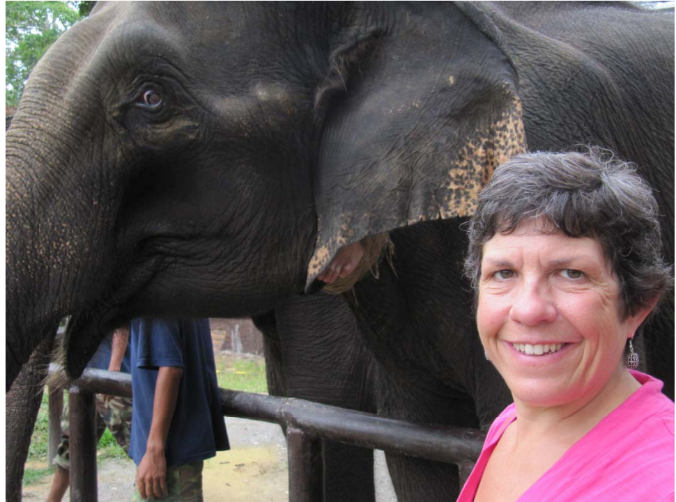
ISIS member at the Calgary Zoo, Botanical Gardens & Prehistoric Park

Many have since been brought back to the wild successfully when habitats were made safe or restored.